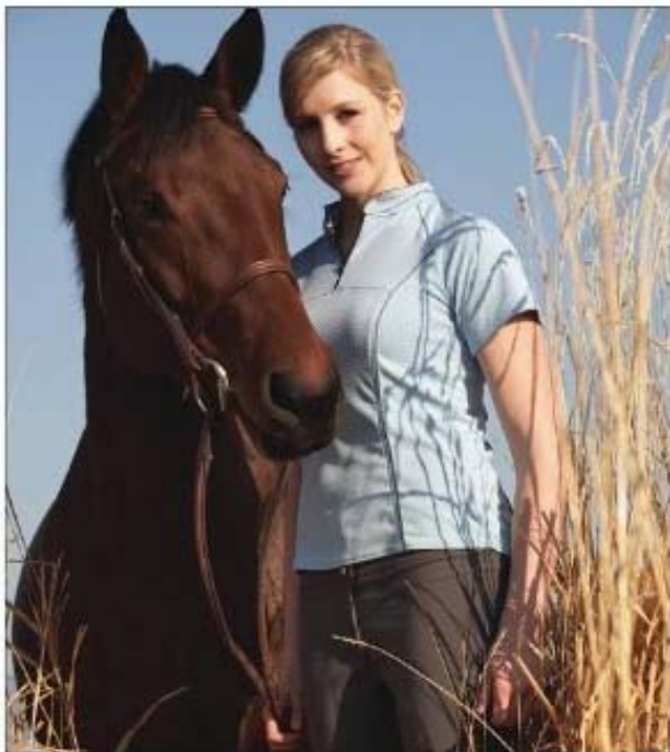
g.r.a.s.s. Climate Shirt