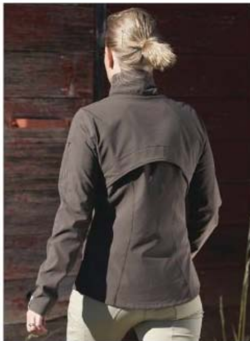
g.r.a.s.s. Eco Zipover

percent more than comparable goods in the Kerrits line, Kent believes that prices will adjust as increased demand for recycled and organic fabrics causes fabric mills to expand their production. "Once people begin choosing organic and recycled goods not just in the equestrian niche, but across the board, prices will come down."