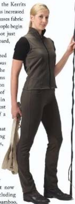
g.r.a.s.s. Eco Vest