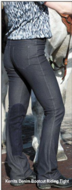
Kerrits Denim Bootcut Riding Tight