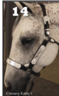
14 Find the most flattering halter cut for your horse!