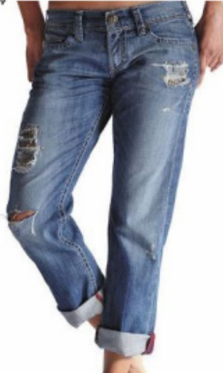
NEW Ariat® Peek-a-Boo Denim Relaxed and Easy - Relaxed Through the Hips - Low Rise - Straight Leg Meant to Cuff

Horse Clothing continues to keep up with all the trends as well. Turn Out Blankets and Sheets provide ultimate freedom and high tech protection for your equine partner by offering breathability and waterproofing in fashionably friendly fabrics and materials with designs from conservative solids, traditional plaids and sleek stripes to the latest retro and psychedelic looks! Nylon "Designer" Halters and English Saddle Pads are available in every color of the rainbow and patterns that range from snappy plaids to hot rod flames. Western Saddle Pads are available in every color and pattern from basic to bling and offer features such as non-slip, breath-