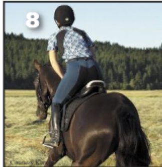
8 Our exclusive Durabreathe™ fabric is combined with GripStretch™ panels for a unique, athletic, figure-flattering look found in the Kerrits Breathe Tight II Fullseat Riding Tight.