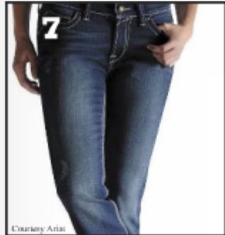
7 Designers are showing riding wear that goes from "in the saddle" to "on the street".