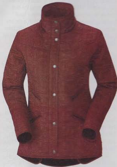
Shoe-In Quilted Jacket $199

Shop online at www.kerrits.com . Press release provided by Kerrits.