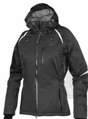
Mountain Horse Winnipeg

Because riders spend much of their time outdoors in the elements and engage in a high output, stop-start athletic activity, we think the top four essentials of a winter riding jacket are: windproofing, waterproofing, breathability, and movement.