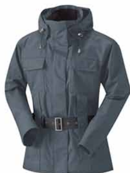
Kerrits Cargo Jacket